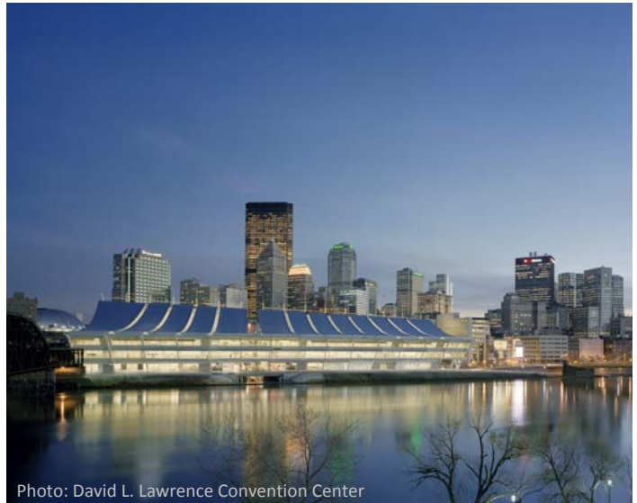
Photo: David L. Lawrence Convention Center

The Welcome Social on Sunday , September 12 th will be held in the David L. Lawrence Convention Center. This facility is the first “green” convention center in the world and has been awarded the Gold LEED® Certification by the U.S. Green Building Council. You will find the facility and gracious staff dedicated to “green first” by reducing waste and recycling in the operation and administration of the building. Overlooking the Allegheny River, the Convention Center provides surroundings aligned with the meeting theme of “Merging our Deeper Currents” as well as serving as a comfortable environment for participants to partake of food and beverages.